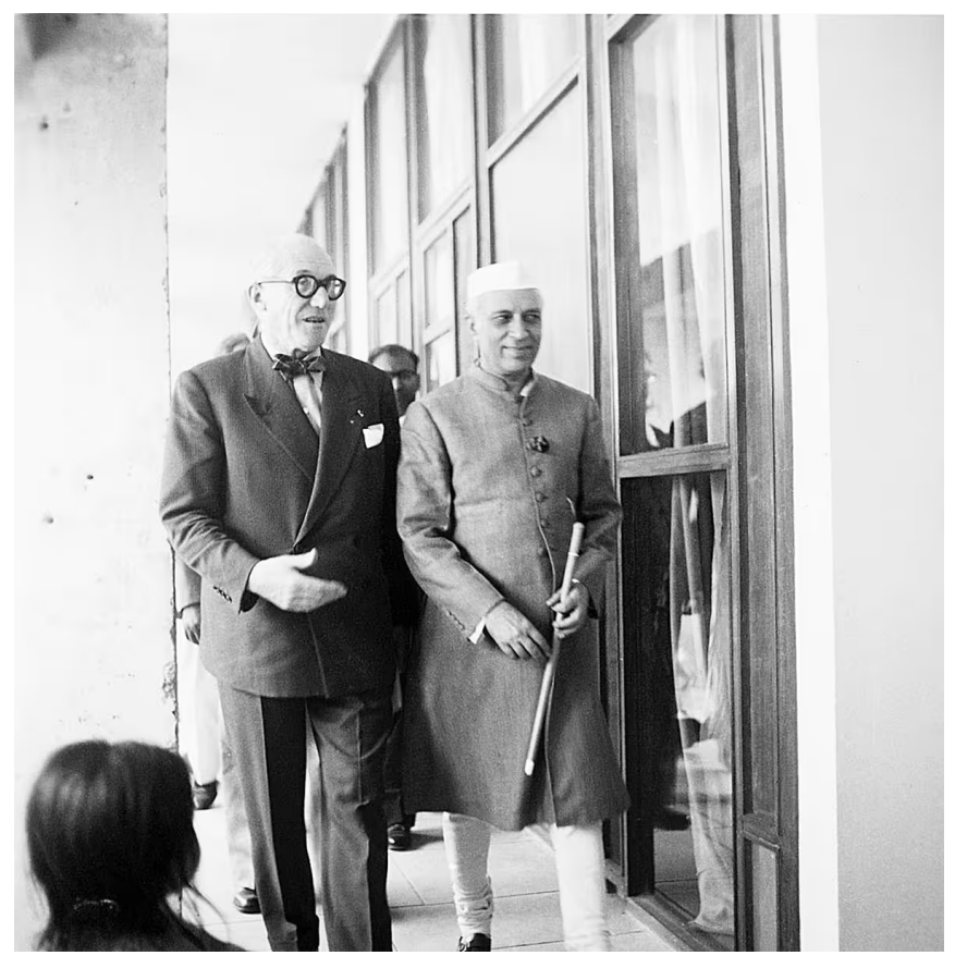
Le Corbusier with Jawaharlal Nehru

today have heritage status. The Chandigarh Master Plan 2031 states that the population density during the last five decades has increased ninefold, from 1,051 to 9,252 persons per sq. km. According to the 2011 Census, the population is 1,055,45.