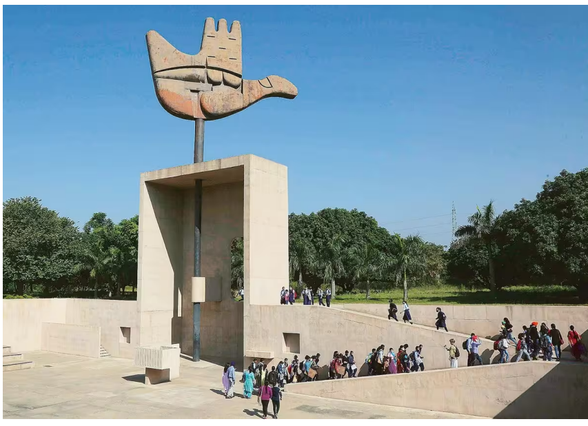
The Open Hand monument

With Partition , western Punjab ceded its capital city of Lahore to Pakistan. The Indian part of the state had a million refugees and no capital. After months of deliberation, then Prime Minister Jawaharlal Nehru decided it best to create a new capital than carve out one from its rural centres. The then chief engineer of Punjab, PL Varma, and PN Thapar, state administrator of the Public Works Department (PWD), chose the site and gave it the name, Chandigarh, after the Chandi Mandir in the same vicinity.